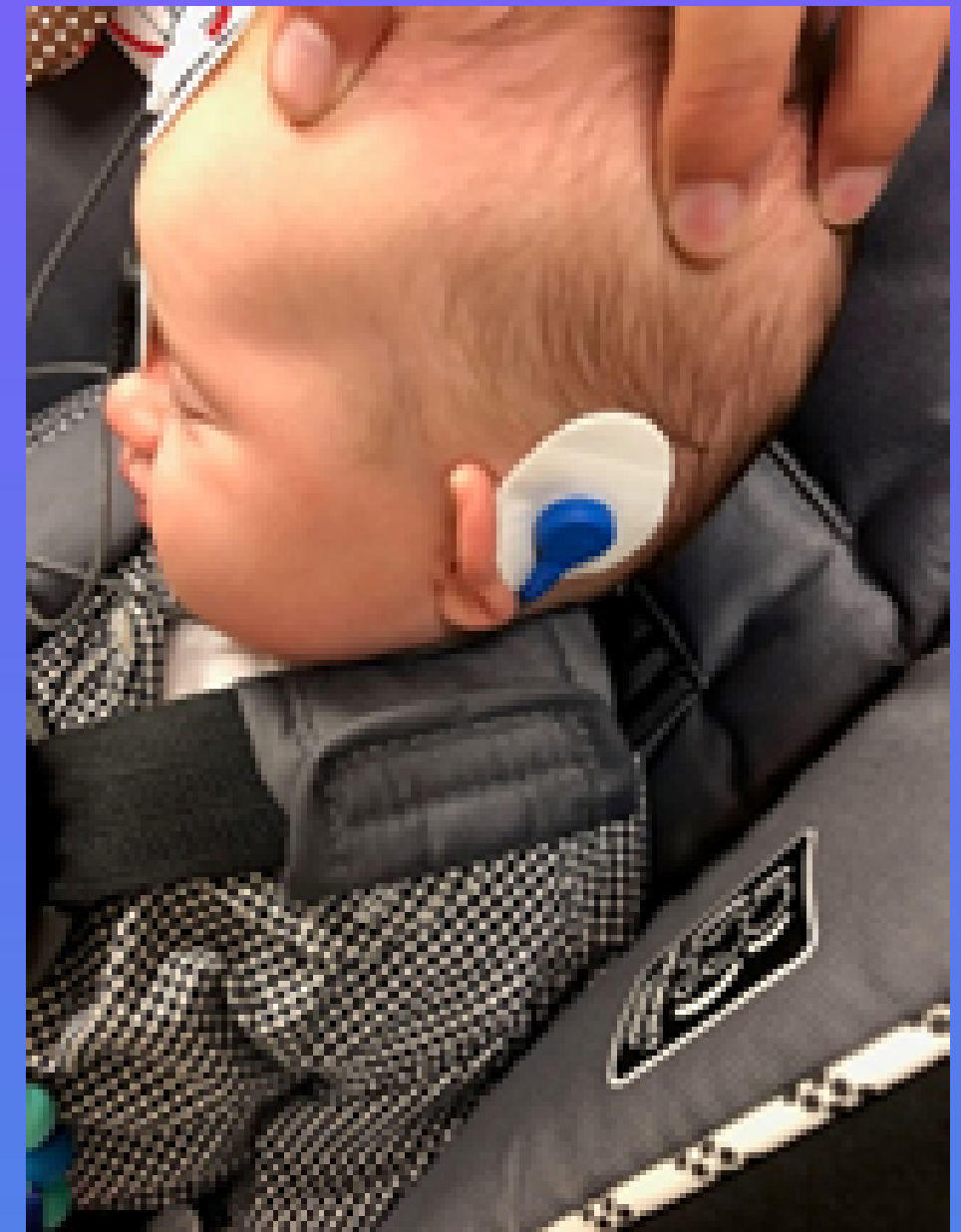
Blue Electrode: Left Mastoid