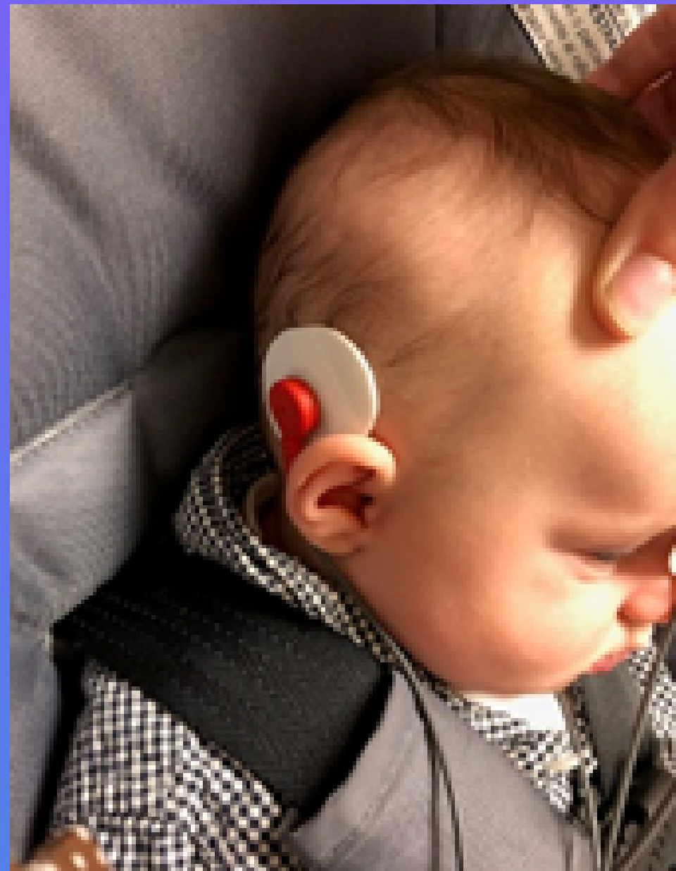
Red Electrode: Right Mastoid